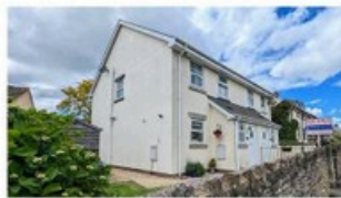
3 BEDROOM TOWN HOUSE Village Drive, Gorseinon, Swansea Min: $400,000 Max: $600,000