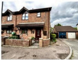
5 BEDROOM DETACHED HOUSE Park Road, Tiverton Min: $800,000 Max: $1,200,000

Invest with Foxtonglobal today and pave the way for a prosperous financial future.