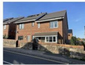
3 BEDROOM SEMI-DETACHED HOUSE Colebrooke, Crediton Min: $230,000 Max: $550,000